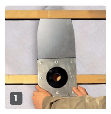
Hanging in the battens