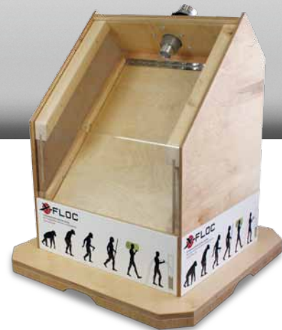
Exhibition model EM3XX and M95 Zellofant