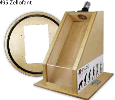
Exhibition model compact with adapter plate for M95 Zellofant