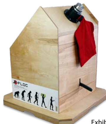
Exhibition model from the backside