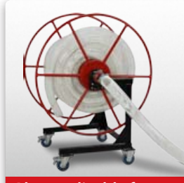
Also applicable for hose reels D1000 and D1000-plus!